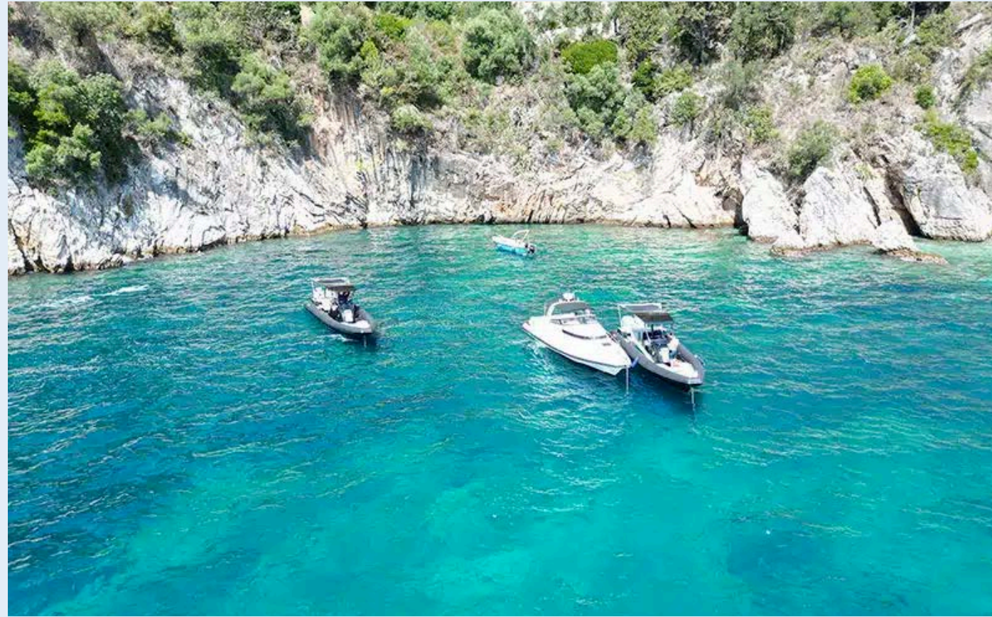
Agios Arsenios Cave