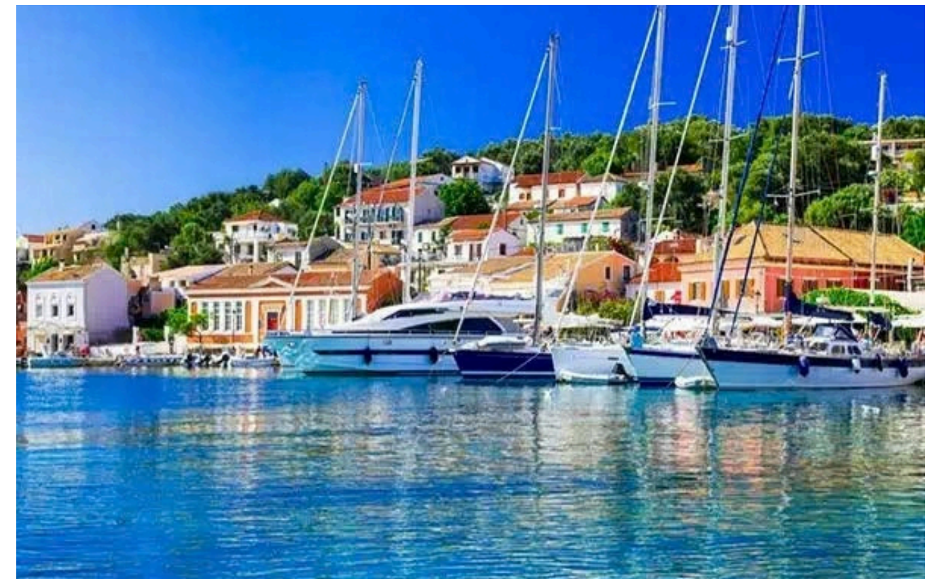
Gaios or Loggos Village

Both villages offer traditional seaside tavernas, stone-paved alleys, and a cozy, authentic island atmosphere —ideal for a laid-back meal with a view.