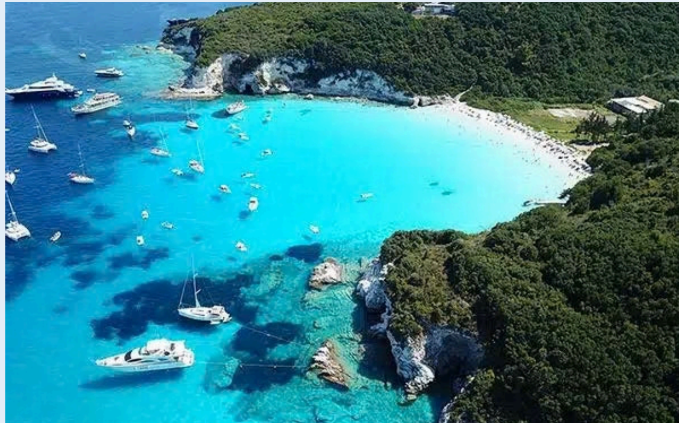
Voutoumi Beach – Antipaxos