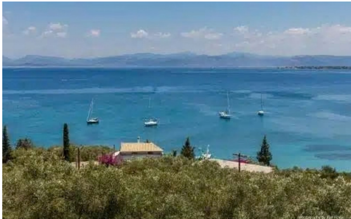
Panorama Notos (South Corfu)

On the return trip, cool off with one last swim stop at Panorama Notos , located on the southern coast of Corfu. This hidden gem offers peaceful waters, rich marine life, and a serene setting for swimming or snorkeling to wrap up your cruise.