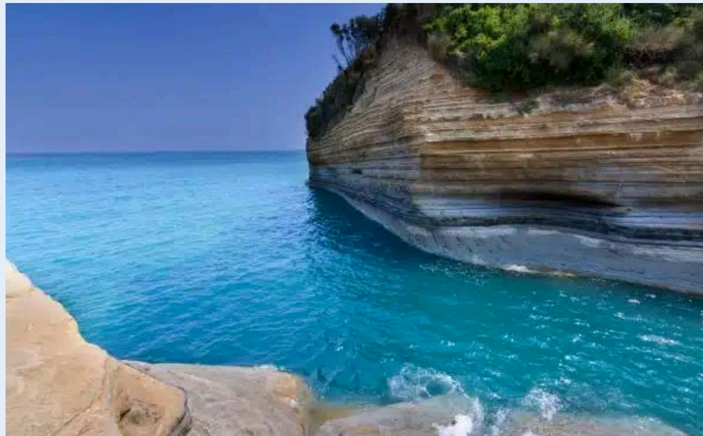
Canal d' amour

Immerse yourself in the legendary tales of love and enjoy the crystal-clear waters that have made this place an absolute must-visit for visitors to Corfu.