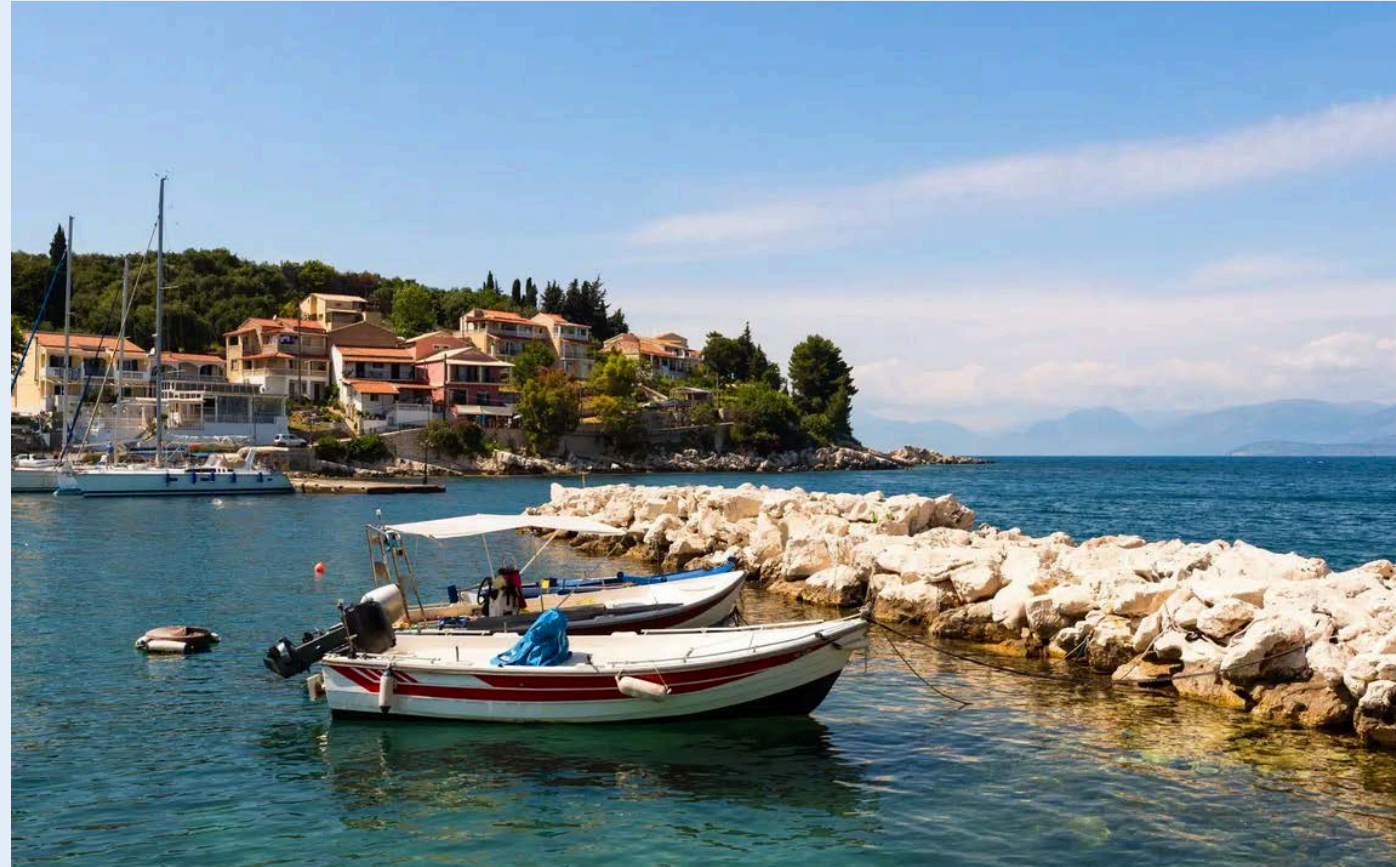
Agios Georgios Port

A picturesque coastal village where you'll enjoy a traditional Greek lunch at a local taverna right by the sea.